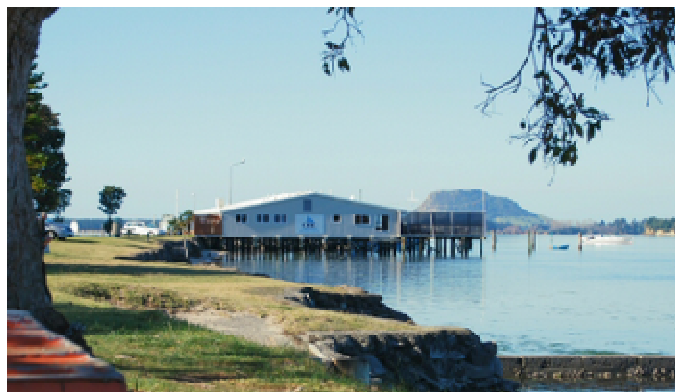
Right - The club today.