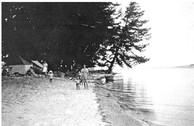
Left - 1950 - Boat club site.